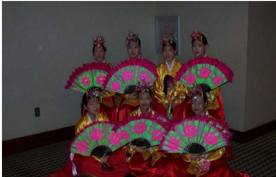
Cultural Interlude Dance Performers

Are you still trying to decide if you should make plans to attend the 18th Annual NAME International Conference in New Orleans, LA., November 12-16, 2008? Well, just look at these pictures from Baltimore and a testimonial from a first-time attendee who clearly expressed the value of NAME conferences. These items should help you make the right decision . . . “I can’t miss a NAME Conference!” See the next page for what awaits you and we’ll see you in ‘Nawlin’s.