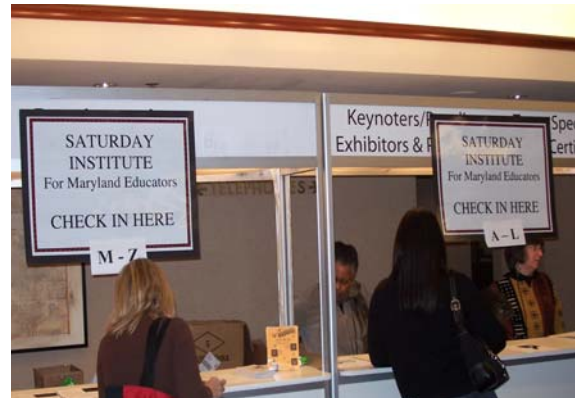
Participants check-in for the Saturday Institute for Teachers