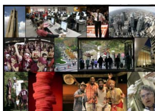
Scenes from Temple University